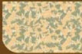
OAT MEAL #014E57