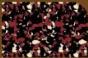
BRUSH FIRE #004E66