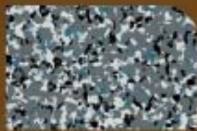
LIQUID METAL #014E64