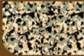
GLADE MOSS #004E61