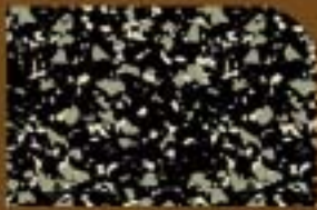
SPANISH MOSS #514E58