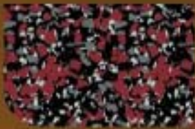
MOLTEN LAVA #014E67