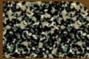
PIXIE MOSS #014E60