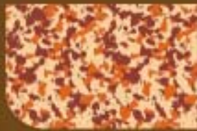
HOT SALSA #014E69