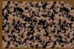
MUDDY WATER #014E52