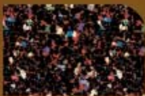
FOSSIL PAINT #52P6E18