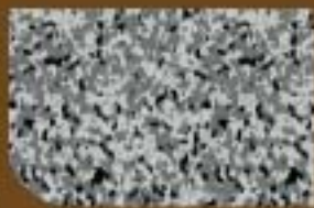
SPUN SILVER #014E65