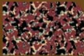
BURNING EMBERS #014E68