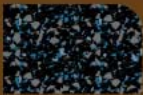
SAPPHIRE HAZE #514E62