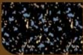
SMOKY AZURE #514E63