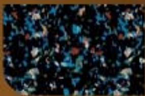
FOSSIL FUEL #52P6E20