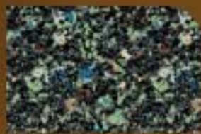
FERN FOSSIL #52P6E17