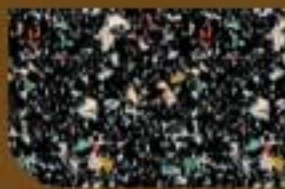
SHELL FOSSIL #52P6E21