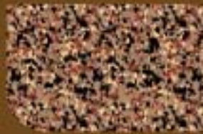
BAKED CLAY #001E53