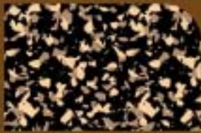
STONE GROUND #014E54